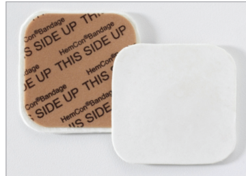
2 x 2 HemCon® Bandage (HEM225)