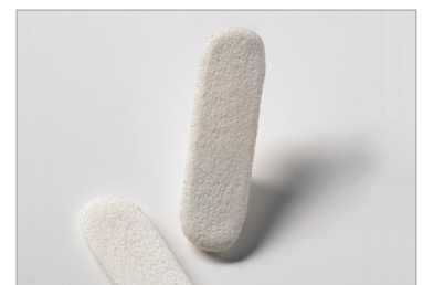
HemCon® Nasal Plug (PN132)