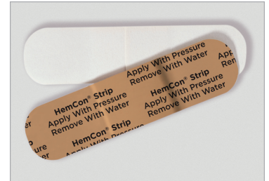
HemCon® Strip (HEM250)