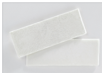
1 x 3 ChitoFlex® (HEM255)