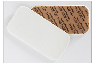
2 x 4 HemCon® Bandage (HEM226)